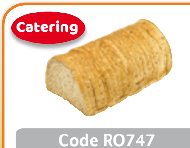
Bloomer Malted Wheatgrain Thick