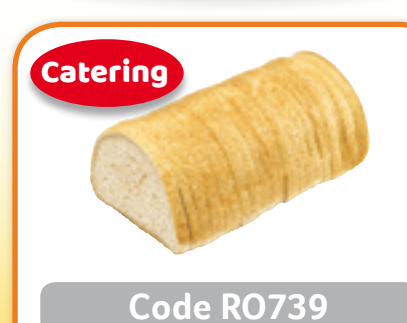
Bloomer Wholemeal Sliced