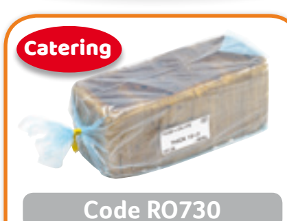
Tomato & Olive Thick 800g