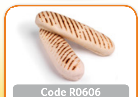
Panini x 2