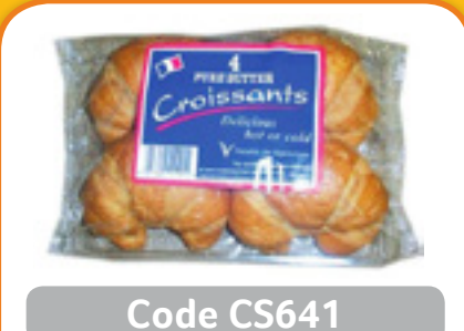
Croissants x 4