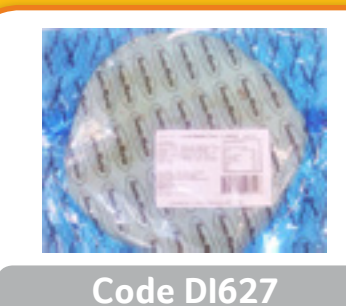
Tortilla Wraps x 10