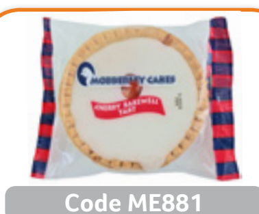
Assorted Bakewell Tarts x 24